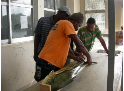
Project for Promotion of Grace of the Seas for Coastal Villages in Vanuatu, Phase 2

Vanuatu Fisheries Department Japan International Cooperation Agency IC Net Limited